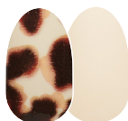
Show and Shell creme