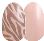
All Wild Up creme