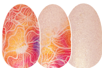
Poppy That shimmer