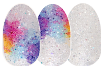
Paint the Town