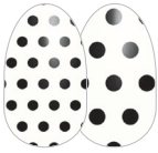
Polka Dot-com clear