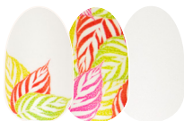
As It Ferns Out creme