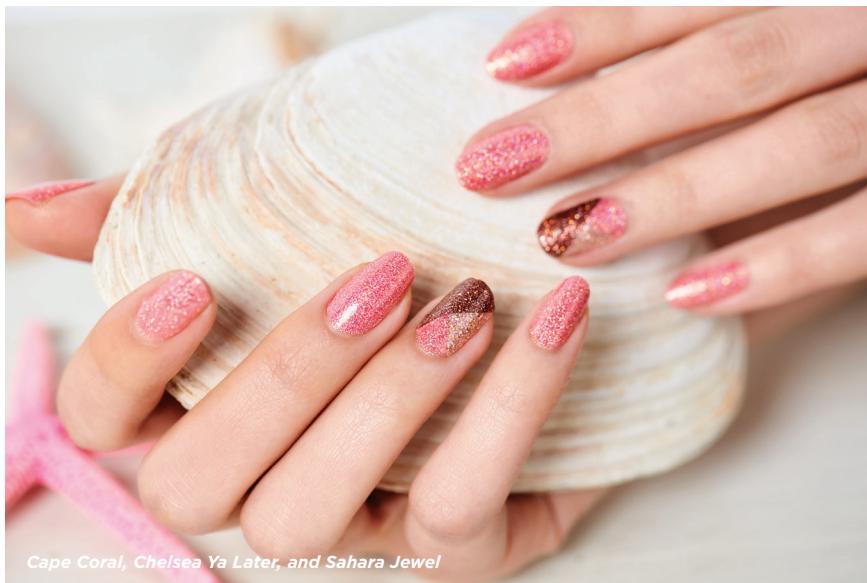
Cape Coral, Chelsea Ya Later, and Sahara Jewel