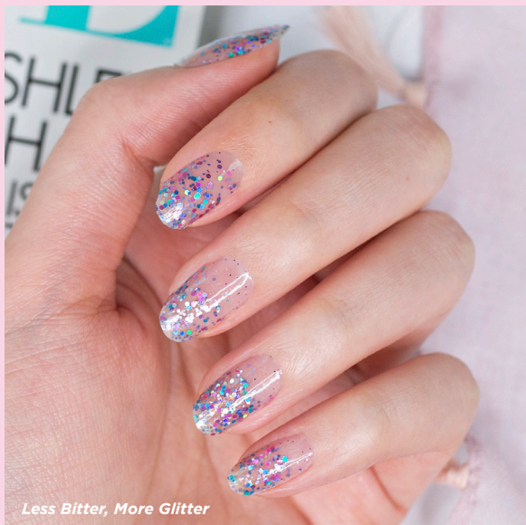
Less Bitter, More Glitter